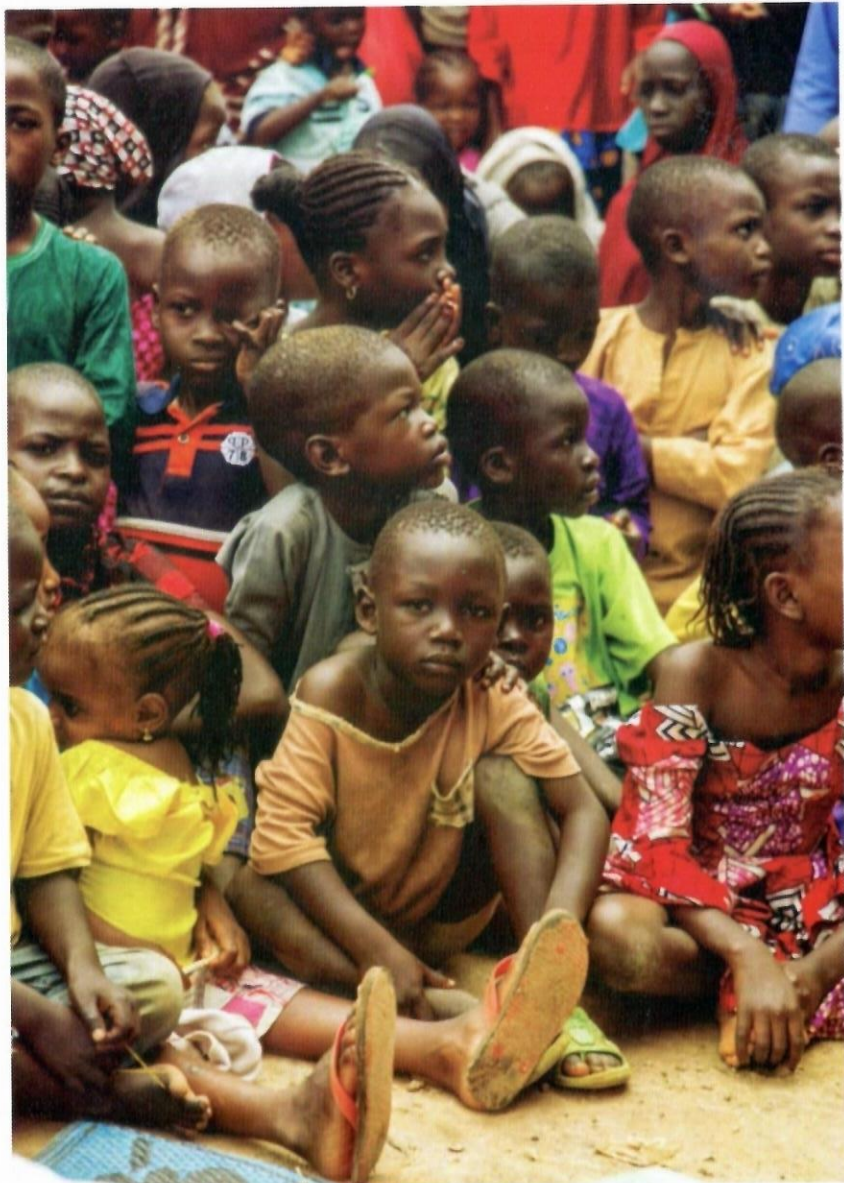
Young children displaced by violent conflict from the Northeast taking refuge in Abuja