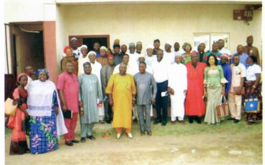
Benue State participants in a group photograph at the CAN Secretariat