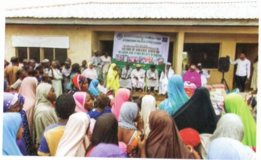
Commemorating the UN International Day for Victims of Violence Based on Religion with IDPs in Abuja