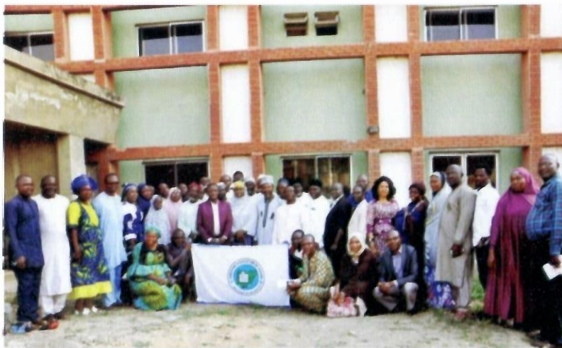
Launch of Mediation Team at CAN Secretariat, Kaduna State