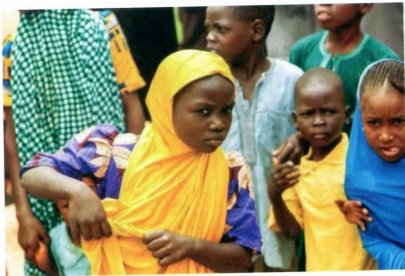
A young child in one of the IDP camps in Abuja