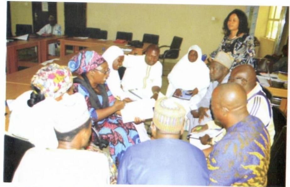
Participants from Zamfara State during a group exercise on Negotiation