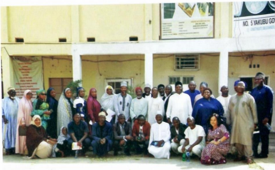
Launch of Mediation unit at JINI Kaduna State