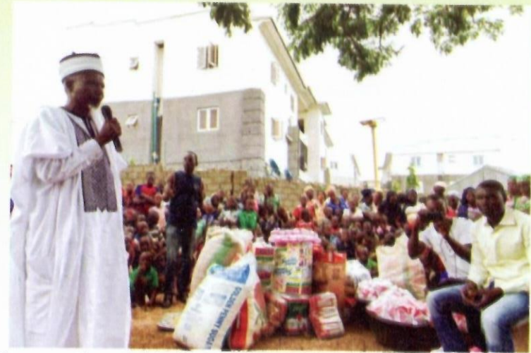
Cross-section of elderly IDPs at the New Kuchigoro camp in Abuja

effectiveness, coordination and sustainability. The funds for these quarterly meetings will come from the line budget on administrative support to mediation units.