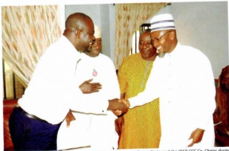
Special Adviser to the Benue State Governor with the JMI Chairman Benue State and the IDFP CCC Co-Chairs during the launch of the Benue State Interreligious Mediation Team