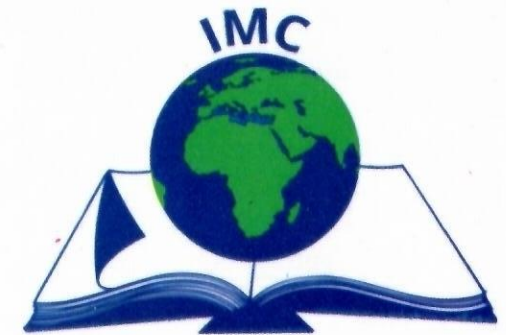
INTERFAITH MEDIATION CENTRE (IMC)