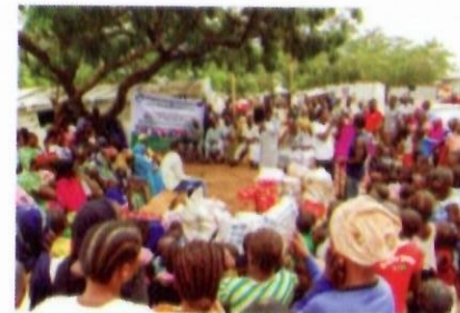
Cross-section of elderly IDPs at the New Kuchigoro camp in Abuja