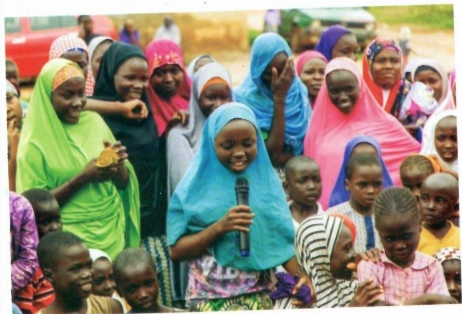
A young girl from one of the IDP camps soliciting for educational support to children in the camp