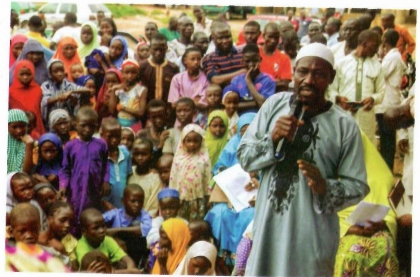
One of the camp leaders sharing their experiences of surviving as IDPs