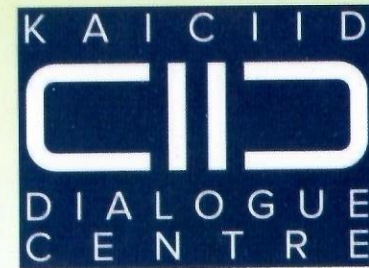
INTERNATIONAL DIALOGUE CENTRE (KAICIID)