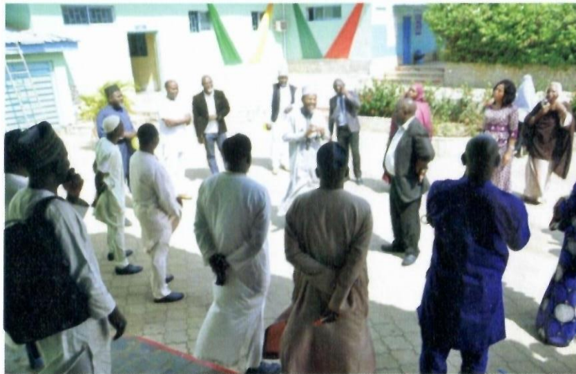
Kaduna State participants during a role play on labelling