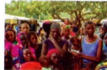
Cross-section of elderly IDPs at the New Kuchigoro camp in Abuja