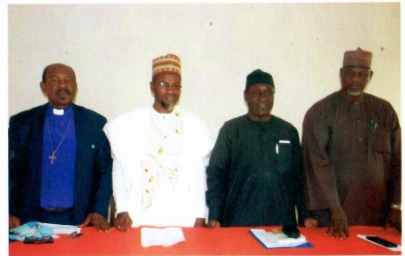
Taraba State CAN Chairman, IDFP CCC Chairman, Special Adviser to Taraba State Governor and the Secretary Taraba State Muslim Council during the inauguration of the Joint Interreligious Mediation Team