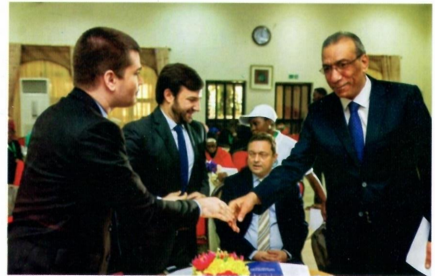
Some Representatives of the Diplomatic Community during the 2019 General Assembly