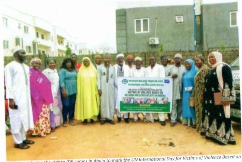
IDFP team during the visit to IDP camps in Abuja to mark the UN International Day for Victims of Violence Based on Religion and Other Beliefs