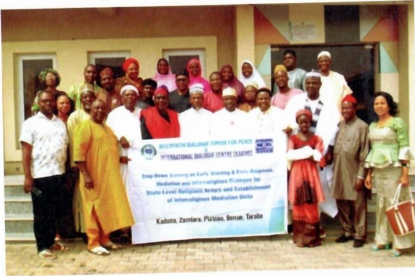
Participants of the Benue State EWER/Mediation Step-Down Training in a group photograph